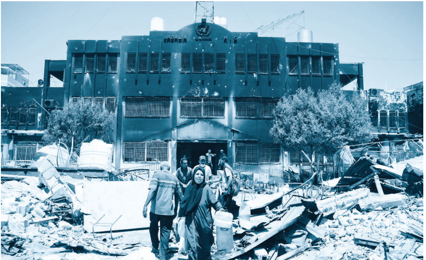
Top: Palestinians salvage belongings from a damaged UN-run school in the Jabalia refugee camp in the northern Gaza Strip after they returned briefly to check on their homes, amid the Israel-Hamas conflict.

which failed to prevent genocidal attacks on the Tutsis by Hutu extremists, has suggested that “the sooner people start dropping the idea of ‘peacekeeping’ the better it will be.”